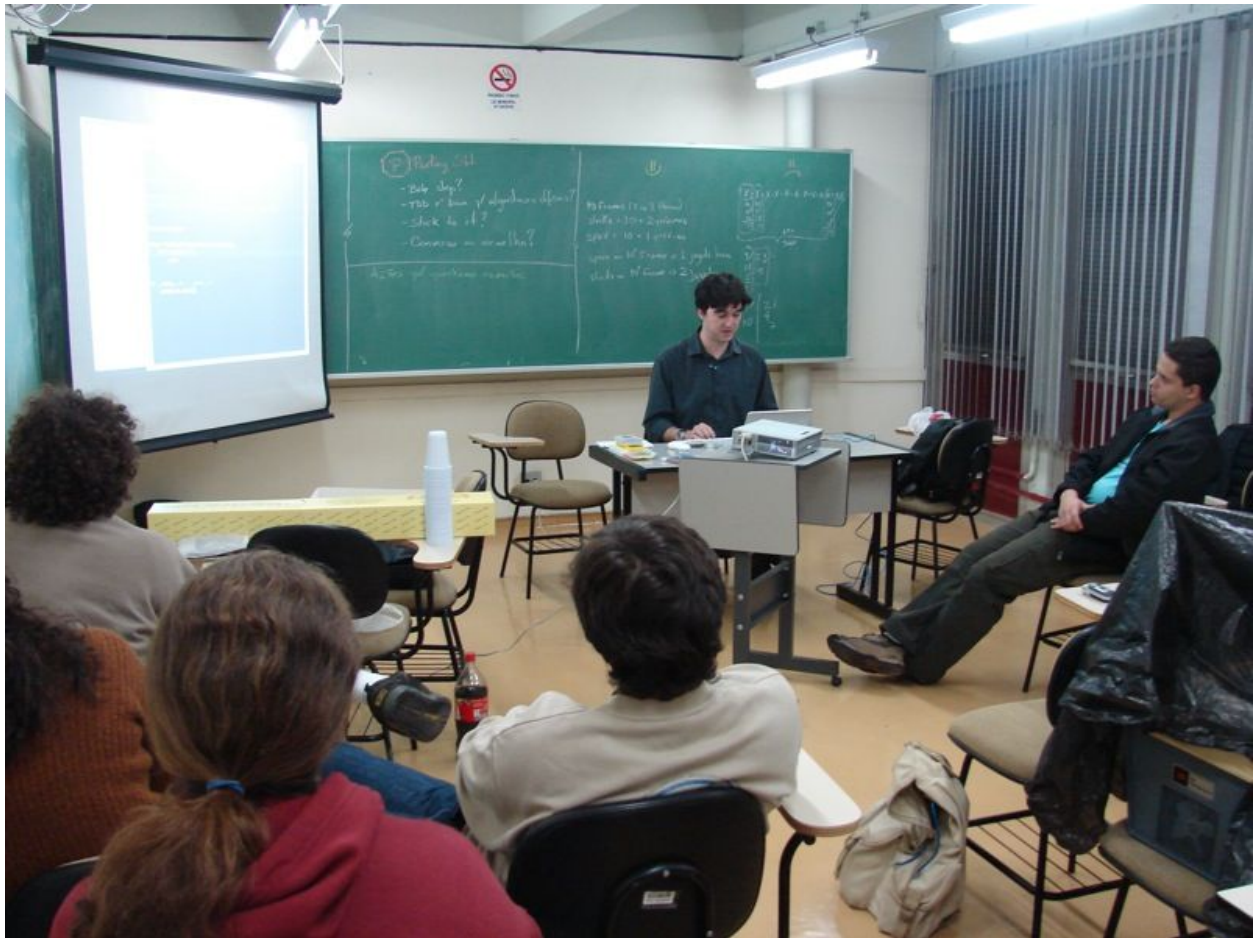
A picture of a Coding Dojo where a functionality is defined on the board.

Also known as To-do List, Class Checklist, TDD Session Roadmap